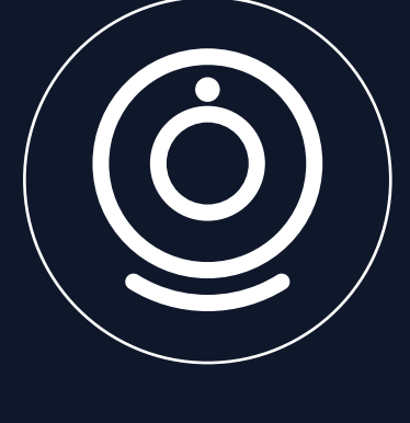
Front 5.0MP Rear 13.0MP