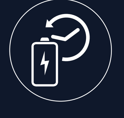
10000mAh 8 hours