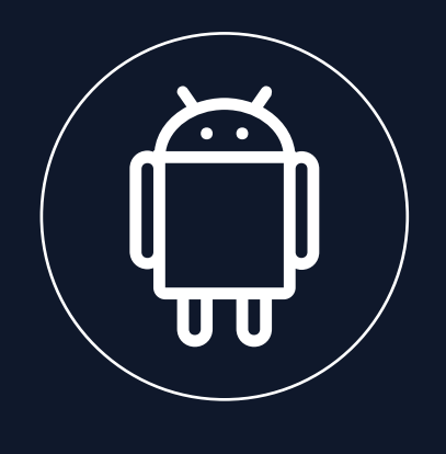
Android 13 Operating System