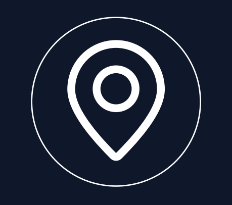
GPS/GLONASS/ Huada Beidou