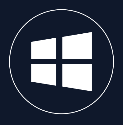
Windows 10 Operating System