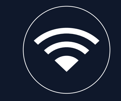
Dual frequency Wi-Fi